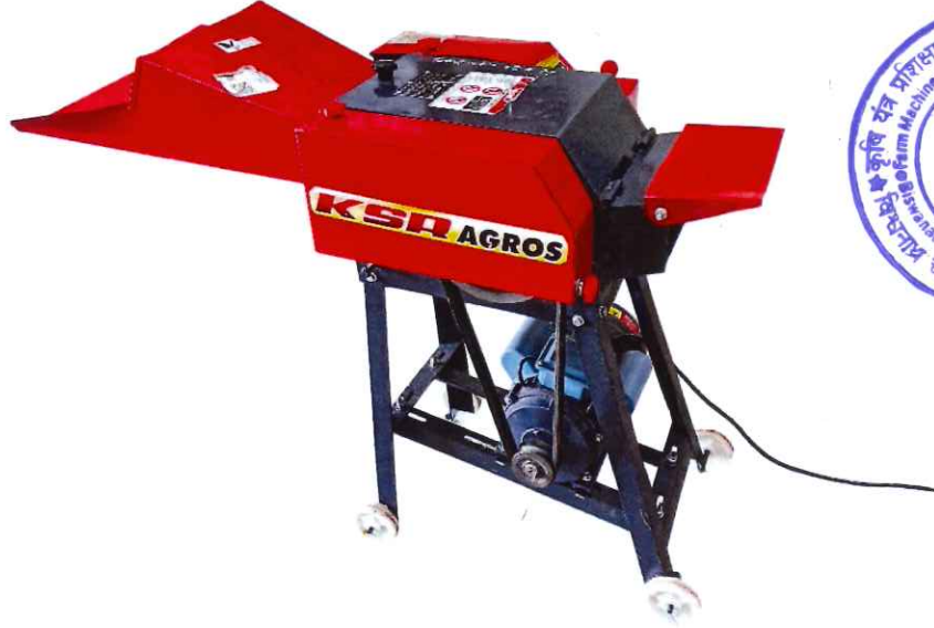
KSR AGRO, KSR-CC-9ZT-1.0, CHAFF CUTTER

THIS TEST REPORT IS VALID UPTO 30.09.2032